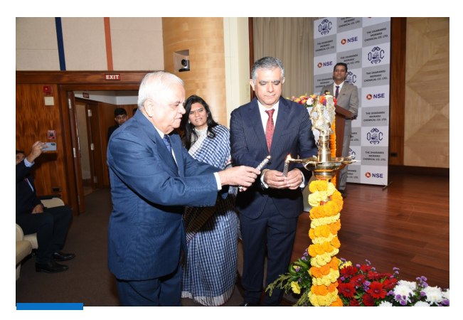
Lamp Lighting Ceremony

It's our mission to continue making world-class products that exceed client expectations, while ensuring our operations are sustainable for the environment and society. Our Roha site is already a zero liquid discharge unit. With the help of improved waste heat recovery and renewable energy, we hope to be carbon negative by March 2023. The Dahej site will also follow in these footsteps shortly.